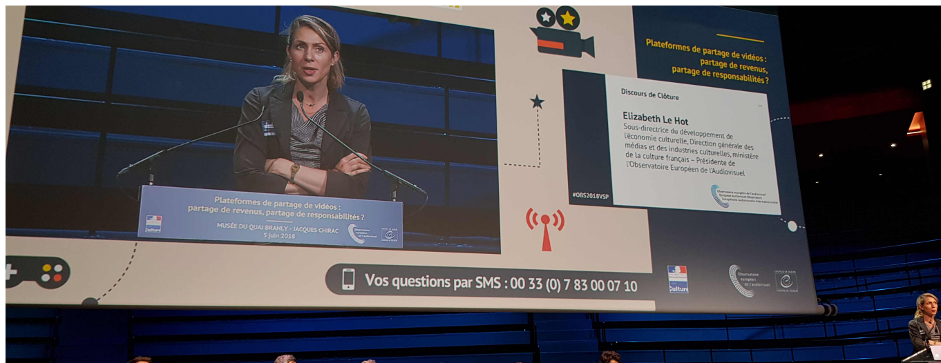
Symposium on the platforms of video sharing