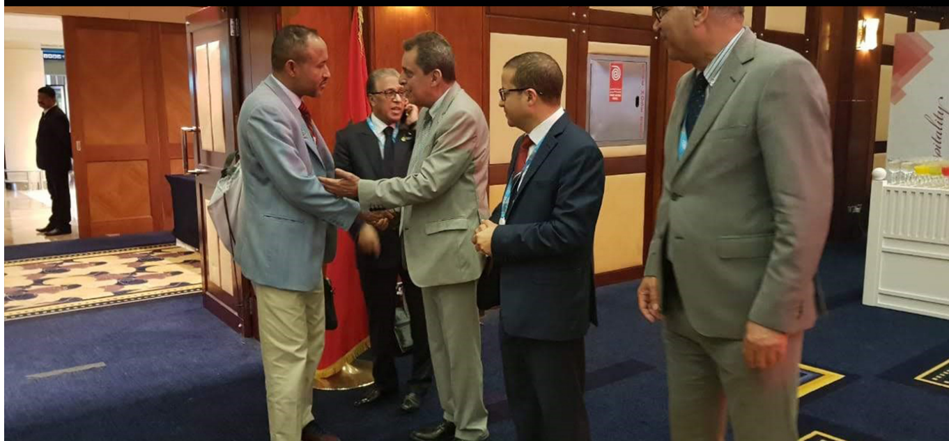
Representative of Mauritania