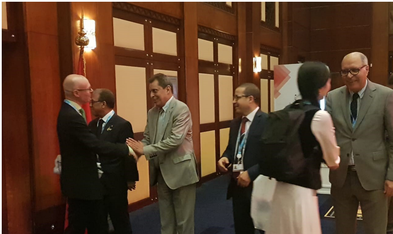
The Head of the Belgian delegation