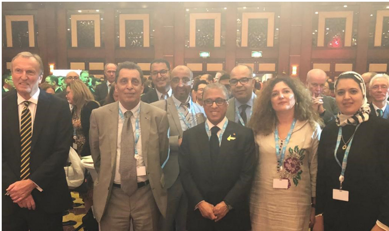
The Moroccan delegation alongside the Deputy Secretary General of ITU