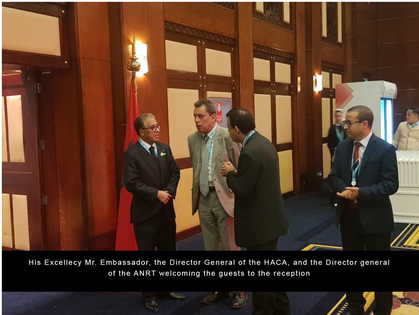
His Excellency Mr. Ambassador, the Director General of the HACA, and the Director general of the ANRT welcoming the guests to the reception