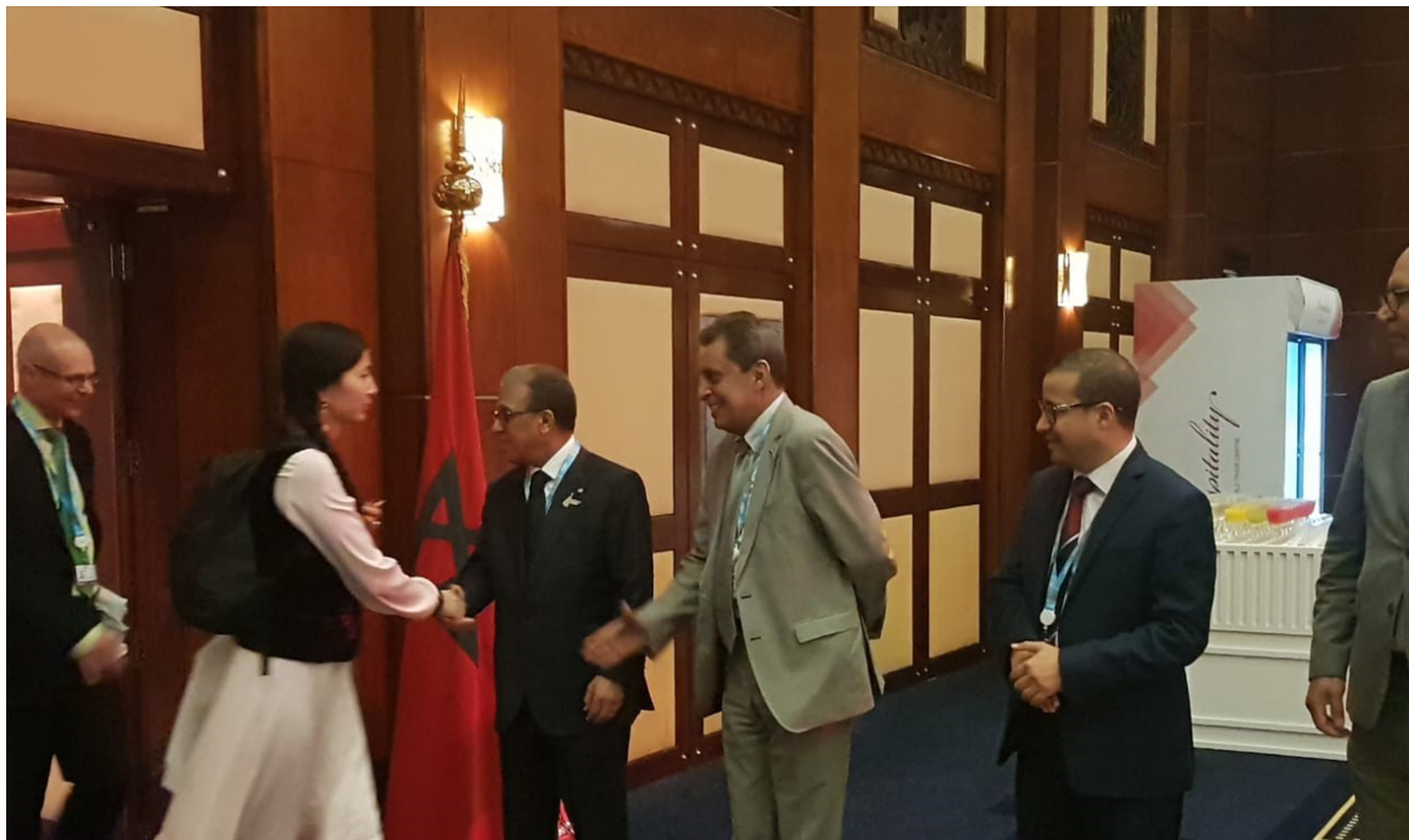
The Moroccan delegation receiving the delegates and representatives of the ITU member countries