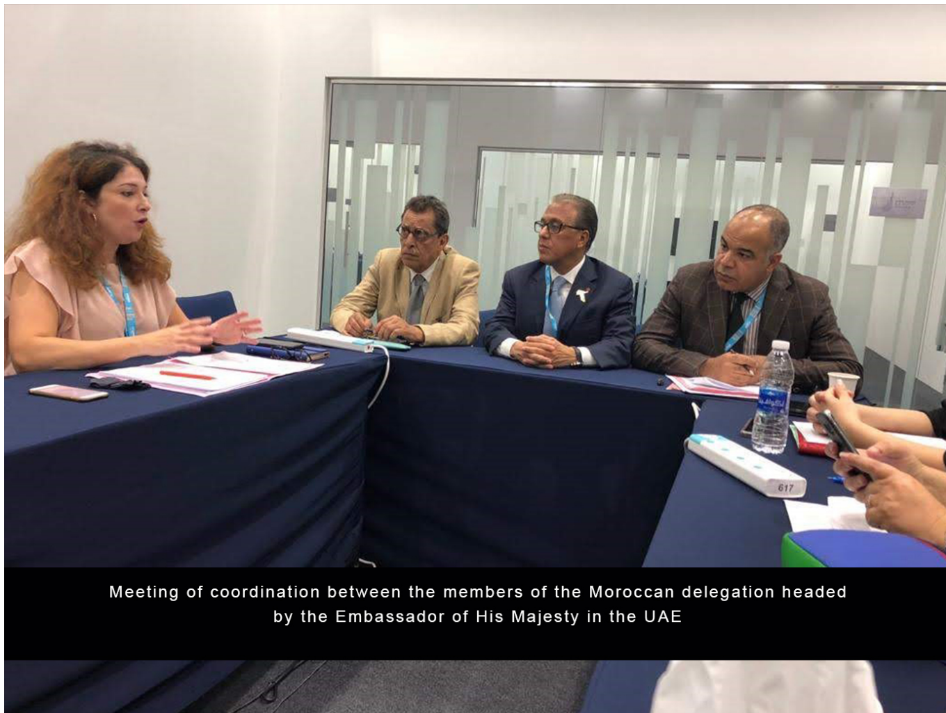
Meeting of coordination between the members of the Moroccan delegation headed by the Ambassador of His Majesty in the UAE