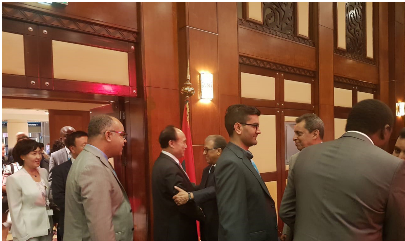
His Excellency Mr. Ambassador receiving the Secretary General of the ITU followed by a Japanese delegation